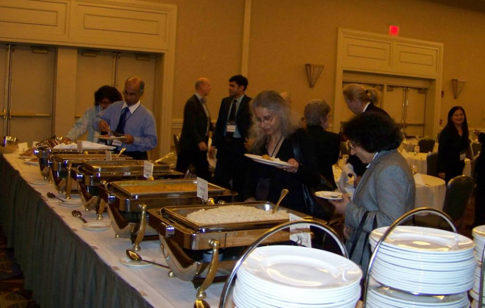
Dinner, USCAP, Boston