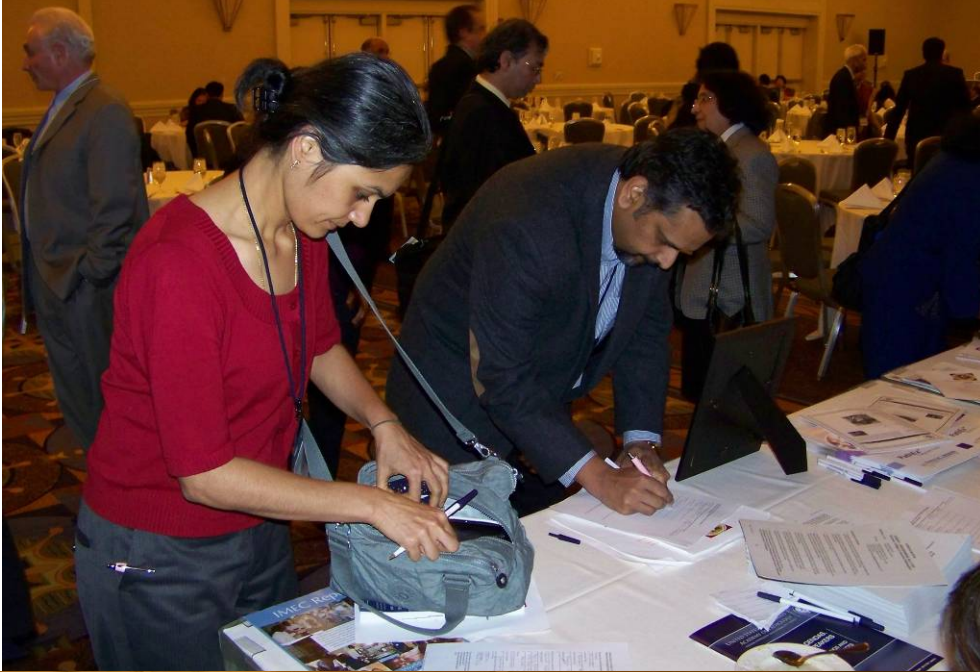
AIPNA registration desk, USCAP, Boston